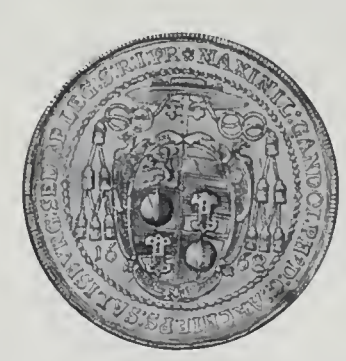
Lot No. 2644

SALZBURG. Max Gandolph von Kuenburg, 1668-1687. 5 Ducats, 1668. Obv. Oval Heraldic Shield. Rv. The two Saints seated face to face. Fr.693, Probszt 1599. Slightly bent, otherwise Very Fine. (2,000-2,750)